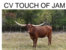
CV TOUCH OF JAM