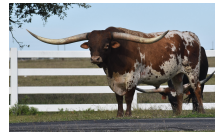
SL Apparent Sage